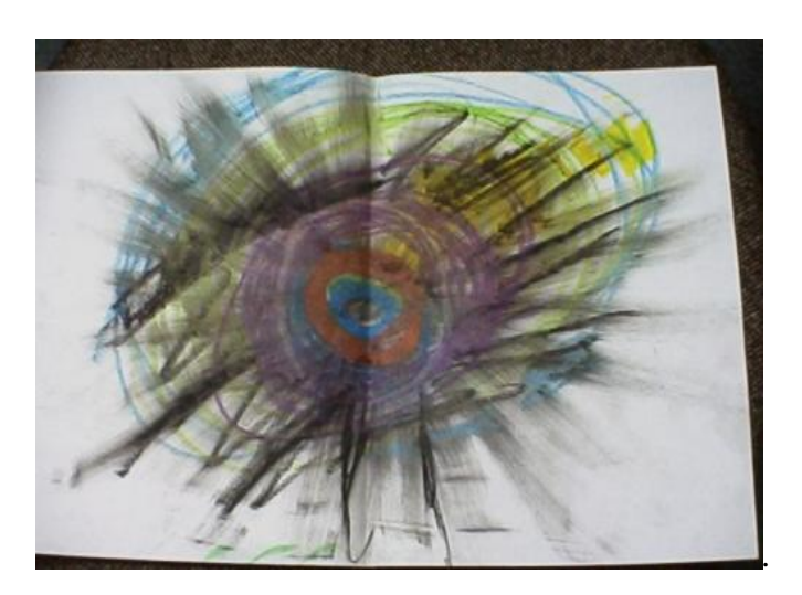
Figure 3: The explosion

This workstation could have a variety of musical instruments available, including whistles and perhaps a moog synthesiser and headphones, so as not to disturb others using the recovery room. A CD or DVD player can also be used by individuals to listen to preferred music or selected passages. The support person at this station could be aware of passages of music that interest the clients - have particular energy for the students while listening. These passages can be discussed. We prefer to use pre recorded soundtrack vignettes (2- 3 minutes) of music from major popular movies which are selected because of the variety of moods and emotions that will be evoked while listening to each piece. The clients are asked to listen to a short piece of music and to represent with paint, crayons, and/or pastels, what they are thinking and what they are feeling.