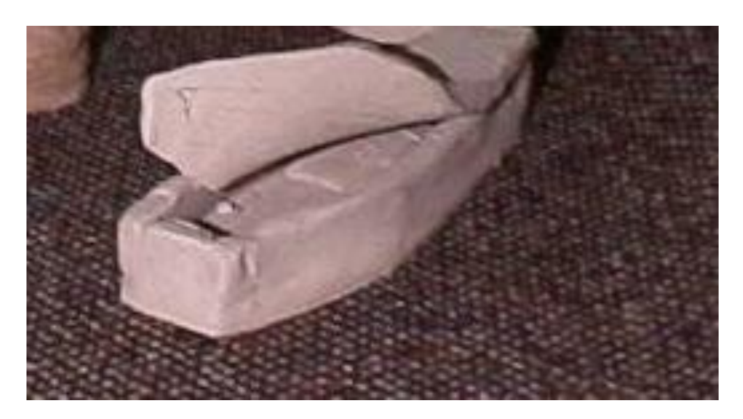
Figure 4: A coffin made of clay.

Sometimes it is necessary to establish this station outside of the recovery room although stations with soft toys, small bean bags, and inflated balloons may be provided inside. Following the death of the school football captain, many team members were reluctant to show any signs of emotion about this unfortunate and unpredicted suicide. The team members were engaged by passing a football around while they remembered the good times with the deceased, the victories and the losses, the friendship and the fun. Other strategies that can be employed include the use of clay, beating and kneading it, using gross muscle to free restricted and blocked feelings.