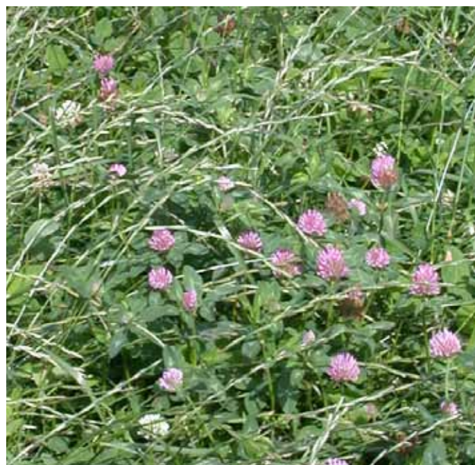
Sward with white- and red clover

Yield under cutting regime was affected by whether the field was previously cut or