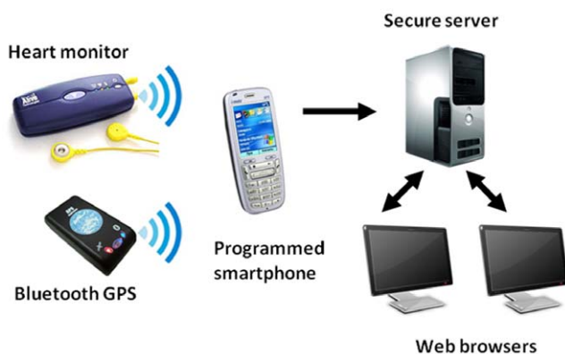
Figure 2. Components of remote monitoring system. doi:10.1371/journal.pone.0014669.g002

prompted the research team to consult the patient’s cardiologist before resuming exercise sessions. These included ST segment changes as well as exercise and post-exercise supraventricular and ventricular ectopic beats.