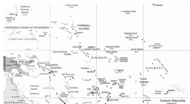
Figure 1. Island nation states of the Pacific region.