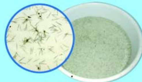
White spot free fry