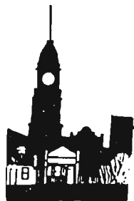
The Crow Collection

A Crow Collection Association has been formed and incorporated. One of its aims is to enhance the comprehensiveness and accessibility of the Collection through Living library Projects.