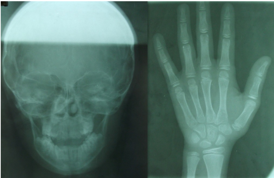
Normal x-ray of the hand & cranial vault with maxillary hypoplasia seen