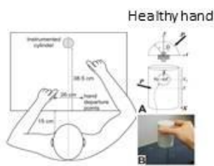
Figure 1: Experimental setup

Five adults with amputation of the upper limb above and below the elbow participated in this study. Each participant was seated and asked to grasp and lift an instrumented cylinder with the healthy hand 15 times (Figure 1). The cylinder enabled to record in real time the opposition axis (the OA, in a precision grip is defined as the line connecting the final position of the thumb and index fingers on the object) as well as the forces applied during the gripping period of 2000 msec. The participants were assessed during the temporary (PP) and definitive (PD) phases of prosthesis fitting after the amputation. Student t-tests were used to determine the effect of different prosthetic phases on the force and orientation of the gripping hand.