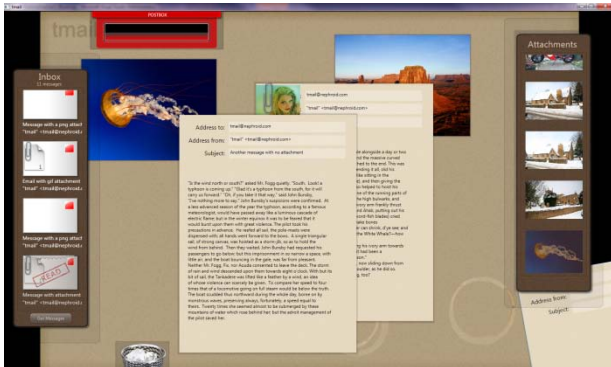
Figure 1: tmail employs visual objects that are familiar to users, and behave predictably.

The tmail application uses a desktop metaphor, with 'unnecessary' functionality (i.e. rarely used features) omitted in order to maintain simplicity and keep perceived complexity to a minimum. See figure 1.