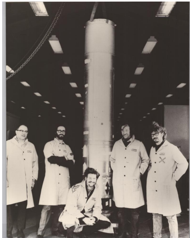
Figure 1. Picture taken in 1970 at Wallops Island of sounding rocket 17.09 featuring two types of X-ray polarimeters. This experiment unambiguously measured the polarization of the