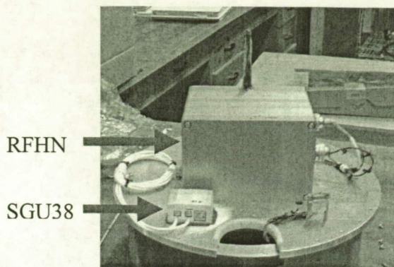
Figure 3 - RFHN and SGU38 Mounted on the Deck Plate

The primary objectives of the flight were to demonstrate the ability of the system to wirelessly transmit and receive data, store the sensor data, and to quantify the reliability of the wireless link during flight. The flight was successful and the objectives were met. The sensors transmitted thousands of packets during the flight. Post flight data analysis showed that the reliability of the wireless link was at least equal to or better than the reliability measured during the ground integration and preflight testing activities. A photo of the RFHN and one of the micro-wireless sensors called the Strain-Gauge Unit (SGU) is shown below.