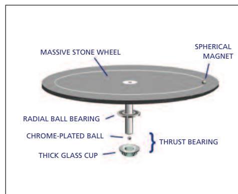
Figure 2. Major Components; support structure and launcher not shown.

Manually supplying the angular momentum for the elastic collision, rather than observing an animation, intuitively conveys the concepts, meeting nine specific educational objectives. Many NASA