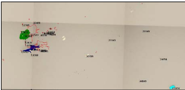
Fig. 5. Inset of sample 61052, position 1. The sizes (in \mu\text{m} ) of detected features are displayed. Objects outlined in red were present before PI return (these do not have measurements displayed). The field of view is \sim 0.1\text{mm}^2 .

References: [1] Calaway M.C. et al (2009) LPSC XL, Abstract # 1183. [2] Calaway M.C. et al (2007) LPSC XXXVIII, Abstract # 1627. [3] Burnett D.S. et al (2006) LPSC XXXVII, Abstract # 1627. [4] Kuhlman K.R. et al (2007) LPSC XXXVIII, Abstract # 1627. [6] Veryovkin I. et al (2011) LPSC XLII, Abstract # 2308. [6] Rodriguez M. et al (2012) LPSC XLIII, Abstract # 2750.