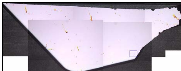
Fig. 1. Sample 60326. Features present at the time of allocation are in yellow. Features present after PI return are in red. The area bounded by the square was scanned at higher magnification (position 1).

Sample 60326: Flown sample 60326 is a silicon-on sapphire (SOS) layered fragment from the bulk-array. It is 22.7 x 9.3 mm in one dimension and has a thickness of 706 \mu\text{m} . The sample has been UPW and exposed to UV ozone cleaning at JSC. It has also had an additional surface cleaning in an HCl bath (Caltech). This sample did not have the benefit of high magnification scanning before its allocation in 2007, but its return to JSC in 2011 provided an opportunity to document the sample surface as part of this cleaning study effort. An overview scan (Fig.1) shows that small features were subsequently added to the sample surface.