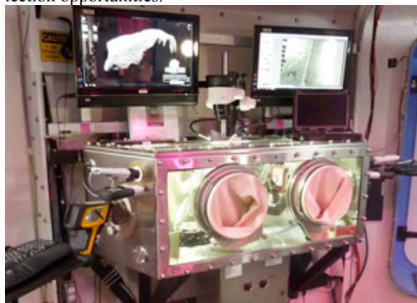
Figure 1. GeoLab inside the DSH. Microscope and computer displays are above the glovebox, XRF is on the left. The MMI is inside the glovebox (see Fig. 2).

Introduction: GeoLab is a geological laboratory and testbed designed for supporting geoscience activities during NASA's analog demonstrations. Scientists at NASA's Johnson Space Center built GeoLab as part of a technology project to aid the development of science operational concepts for future planetary surface missions [1, 2, 3]. It is integrated into NASA's Habitat Demonstration Unit, a first generation exploration habitat test article. As a prototype workstation, GeoLab provides a high fidelity working space for analog mission crewmembers to perform in-situ characterization of geologic samples and communicate their findings with supporting scientists. GeoLab analog operations can provide valuable data for assessing the operational and scientific considerations of surface-based geologic analyses such as preliminary examination of samples collected by astronaut crews [4, 5]. Our analog tests also feed into sample handling and advanced curation operational concepts and procedures that will, ultimately, help ensure that the most critical samples are collected during future exploration on a planetary surface, and aid decisions about sample prioritization, sample handling and return. Data from GeoLab operations also supports science planning during a mission by providing additional detailed geologic information to supporting scientists, helping them make informed decisions about strategies for subsequent sample collection opportunities.