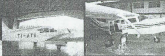
CARTA RC-10 photo and SRTM data