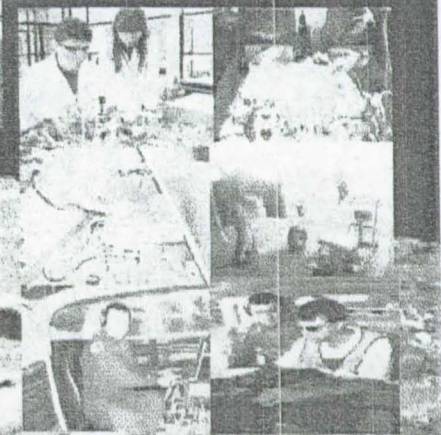
AVEMS instrument description and Operation for CARTA Campaigns