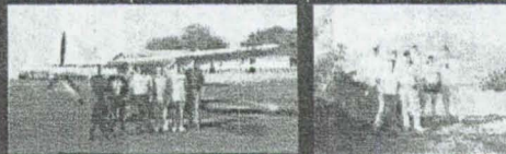
AVEMS team during CARTA 2005 Campaign: PRIAS-CENAT, NASA- KSC researchers and CICANUM-UCR students