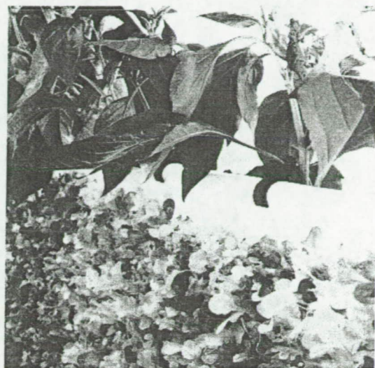
FLEX Aeroponic System for modular rapid pure food production for space and earth

Aerponics International licensed the patent rights of the technology to its parent company, AgriHouse, Inc. Prototypes developed during the Phase I contract in 1999 were delivered to AgriHouse, Inc. which allowed them to commercialize the technology for a low-mass flex aeroponic growing system for both low gravity and terrestrial gravity applications for rapid crop production and expansion. In early 2005, the company began manufacturing of the flexible aeroponics systems that are modular and that incorporate the major advances of the Phase I work.