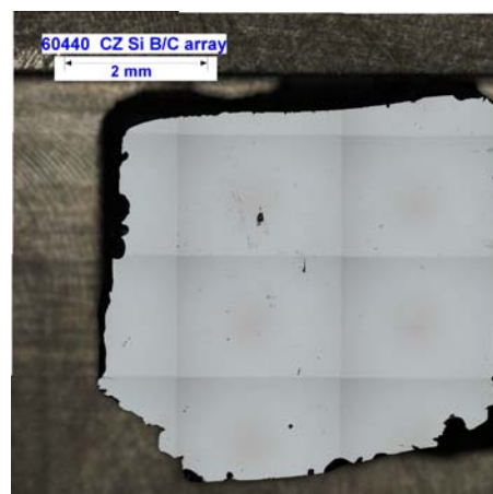
Fig. 1. Sample 60440, after UPW and acid-etch.

Sample 60440. Using comparison data for scanned areas at 50X is new for the Genesis lab. Sample 60440 (Czochnalski silicon, bulk array, Fig. 1) has been the most documented sample in this effort. The sample was cleaned with UPW at JSC, and has also been cleaned by acid etch (Caltech) and has since been returned to JSC. The sample was scanned in three areas at 50X, each about 0.8 mm 2 in area (Fig. 2). Particle distribution data has been collected for each position to illustrate the effects of UPW cleaning and the addition of acid-etch cleaning (Fig. 3). As part of the cleaning verification trail, JSC can perform this repeat imaging on the same areas on each fragment as it is returned to the facility.