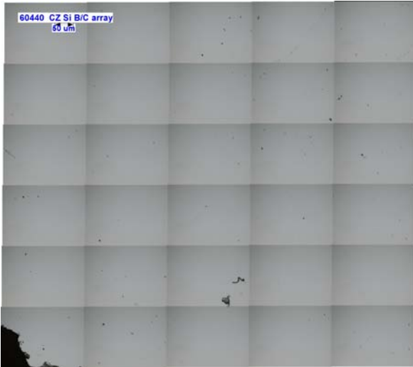
Fig. 2. Position three on sample 60440, after UPW + acid-etch.