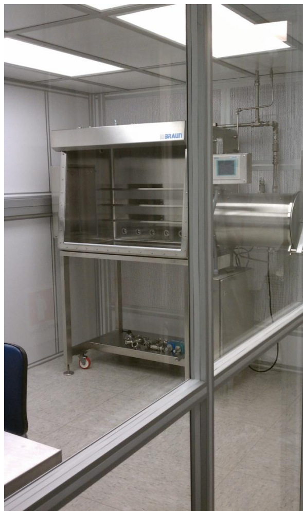
FIGURE 1. The new Hayabusa clean lab and sample cabinet at JSC, after construction has been completed but before ORI clearance. A new glass front for the glove box will be fabricated, and any anodized aluminum parts will be replaced with new stainless steel parts.

Manipulating Sub-mm Asteroid Grains: Although NASA already curates two other collections containing sub-mm extraterrestrial particles, these