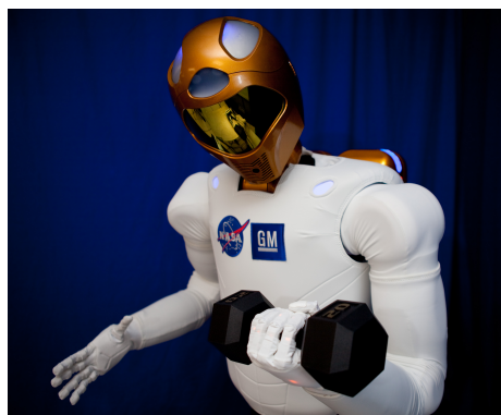
Figure 1: Robonaut 2.

In particular, a multi-tiered software architecture is proposed that combines principles of low-level feedback control with higher-level planners that accomplish behavioral goals at the task level given the run-time context, user constraints, the health of the system, and so on. The proposed architecture is shown in Figure 2. At the lowest-level, the resource level , there exists the various sensory and motor signals available to the system. The sensory signals for a robot such as R2 include multiple channels of force/torque data, joint or Cartesian positions calculated through the robot's proprioception, and signals derived from objects observable by its cameras. The motor resources are the