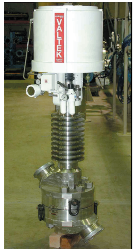
The Split-Body Design of this valve accommodates changes in trim. The heat-exchanger fins help keep the plug stem packing warm enough to function at cryogenic temperatures.

Inquiries concerning rights for the commercial use of this invention should be addressed to the Intellectual Property Manager, Stennis Space Center at (228) 688-1929. Refer to SSC-00159.