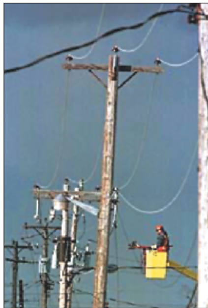
Ice Accumulating on Power Lines poses a hazard. Gauges like those described in the text can provide early warnings of the buildup of ice.

A gauge of this type includes a temperature sensor and two or more pairs of electrically insulated conductors embedded in a surface on which ice could accumulate. The electrical impedances of the pairs of conductors vary with the thickness of any ice that may be present. Somewhat