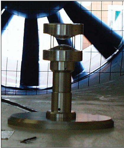
Figure 1. A Prototype Three-Dimensional Venturi Sensor is shown here mounted in a wind tunnel for testing at Embry-Riddle Aeronautical University, FL.

ing limited dynamic range and susceptibility to errors caused by external acoustic noise and rain.