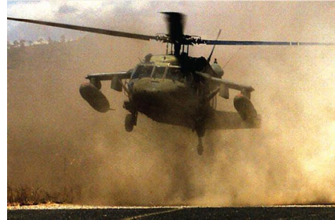
Figure 9. A UH-60 experiencing brownout [18].

Occasionally, when a helicopter is hovering near the ground or coming in to land, dust, snow, etc. get blown around making it very difficult for the pilot to see where the aircraft is with respect to its surroundings. This situation is called brownout. Sandblaster is a system which will help pilots navigate in a brownout situation and help land the aircraft safely. The U.S. Defense Advanced Research Projects Agency (DARPA) helped sponsor Sandblaster during its second phase in research and testing [19]. In this phase, RASCAL was used for flight testing. The DARPA Strategic Technology Office chose a team from Sikorsky in 2006 to build the Sandblaster system which will be compatible with existing aircraft. Because of its capability of being molded into an aircraft similar to the UH-60M Upgrade, RASCAL was an obvious choice for this research.