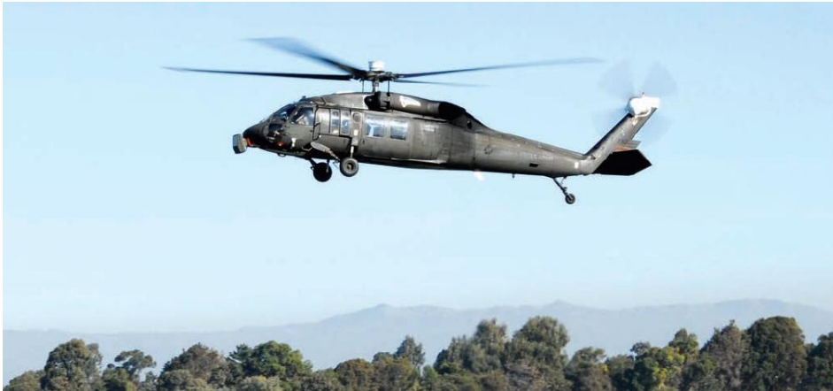
Figure 7. Rotorcraft Aircrew Systems Concepts Airborne Laboratory. [3]

The Rotorcraft Aircrew Systems Concepts Airborne Laboratory (RASCAL) is a JUH-60A, meaning it is one of the earlier models of the Black Hawk. This utility helicopter is very unique. RASCAL is a highly modified JUH-60A used for several research purposes. The U.S. Army Aeroflightdynamics Directorate, NASA Ames Research Center, and Boeing Helicopter at all involved in the