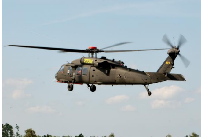
Figure 5. UH-60M Upgrade [11].

There are many concerns about the FCC making decisions during flight. Some worry it will make a fatal decision and the pilot will not be able to correct it if needed. It has been observed that the pilot and the computer will “fight” each other. There have been instances of the pilot being more worried about pushing buttons and such to get the computer to do what they wanted rather than focus on actually flying the aircraft. This can be due to the pilot not being used to the new system. Once it has been in place for a little while pilots will become used to using the new system.