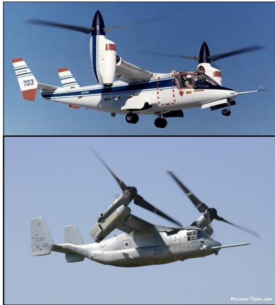
Figure 4. Bell XV-15(Top) [9]. BellBoeing MV-22 (Bottom)[10].

development of this machine came from the realization during a failed hostage rescue mission that the military needed an aircraft which could take off and land vertically as well as have the capability to hold several people and travel at high speeds. Bell Helicopter and Boeing Helicopter were contracted to complete such a feat after submitting a proposal of a model which greatly resembled the Bell XV-15 on April 26 th , 1983. [8]