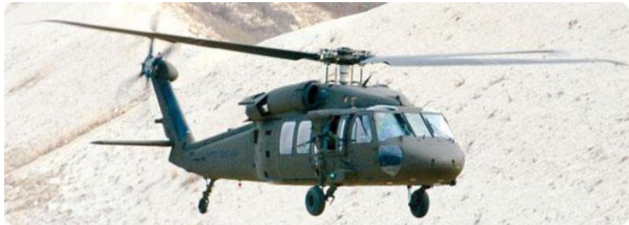
Figure 6. UH-60MU [14].

The UH-60MU is the latest model in development for the Black Hawk family. This is the United States Army’s first helicopter fitted with the FBW FCS with promise of being successful. The Comanche was the U.S. Army’s first rotorcraft with FBW technology but was canceled before put into production [11]. Only two UH-60MUs have been made as of