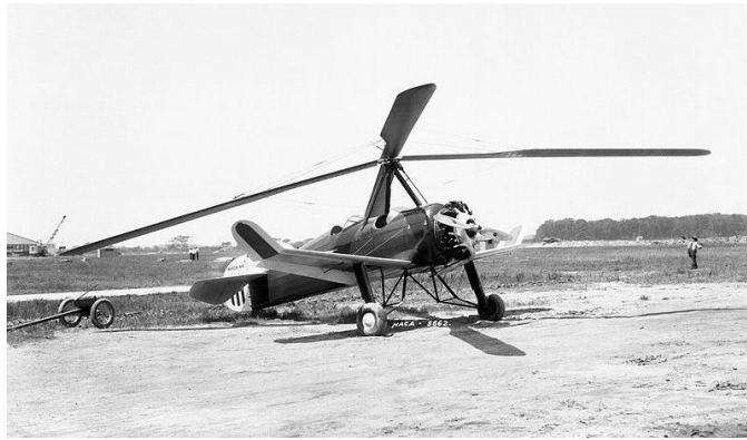
Figure 1. Autogyro built by Pitcairn in the United States under the license of Cierva [2].

The S-2 was built the next year with an airframe which weighed 50lbs less than the previous model. Sikorsky was able to get this aircraft off the ground but it shook violently. The vibrations had proven to be too much for the weak wooden structure. With this Sikorsky took a break from rotorcraft, picking it back up in the United States in the 1930s.