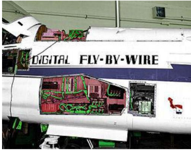
Figure 3. The modified Vought F-8 Crusader used for NASA’s Fly-By-Wire research in 1972 through 1985 [7].

The first flight test of the FBW technology was completed on May 25, 1972 at the Flight Research Center, Edwards, CA, now known as the Dryden Flight Research Center [5]. The plane used for this test was a modified Vought F-8 Crusader, now on display at Dryden and can be seen in Figure 3. This research had the support of Neil Armstrong after the Apollo 11 Mission. He told researchers his knowledge of electronic control systems was available to them if needed for the development of FBW. In fact, the first FBW system used was an “off the shelf back-up, Apollo digital flight control computer (FCC)” [6]. This system also included the inertial sensing unit. This unit is what takes the pilots input and transfers it to the actuators in the F-8 control systems.