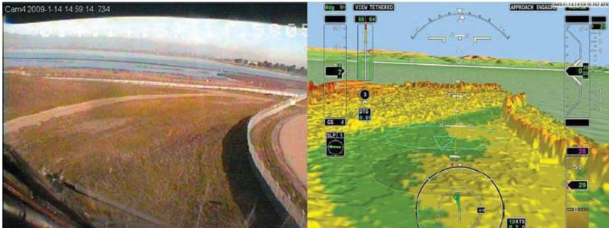
Figure 10. Here is a snapshot of the view from a camera on board RASCAL and the Sandblaster display during one of the test flights [19].

This system was designed to find obstacles from 1000 feet off the ground. These obstacles could be anything that the aircraft would need to avoid but not able to be seen during a brownout landing. The flight testing was completed and Moffett Field, CA. In the test site the AFDD created a variety of obstacles. The height of these obstacles ranged from 1 foot to 4 feet, all of which the system could detect. A wire detection test was also conducted here, proving this system could also spot power lines during a brownout. The Sandblaster system