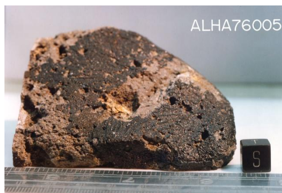
Figure 2a: Mass of ALH 76005 curated at NASA-JSC.