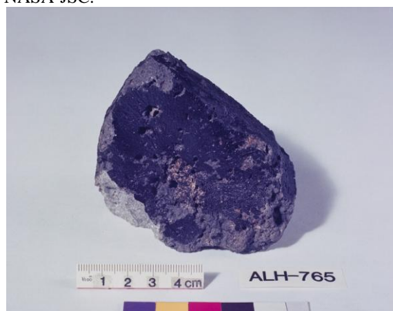
Figure 2b: Mass of ALH 76005 curated at NIPR.