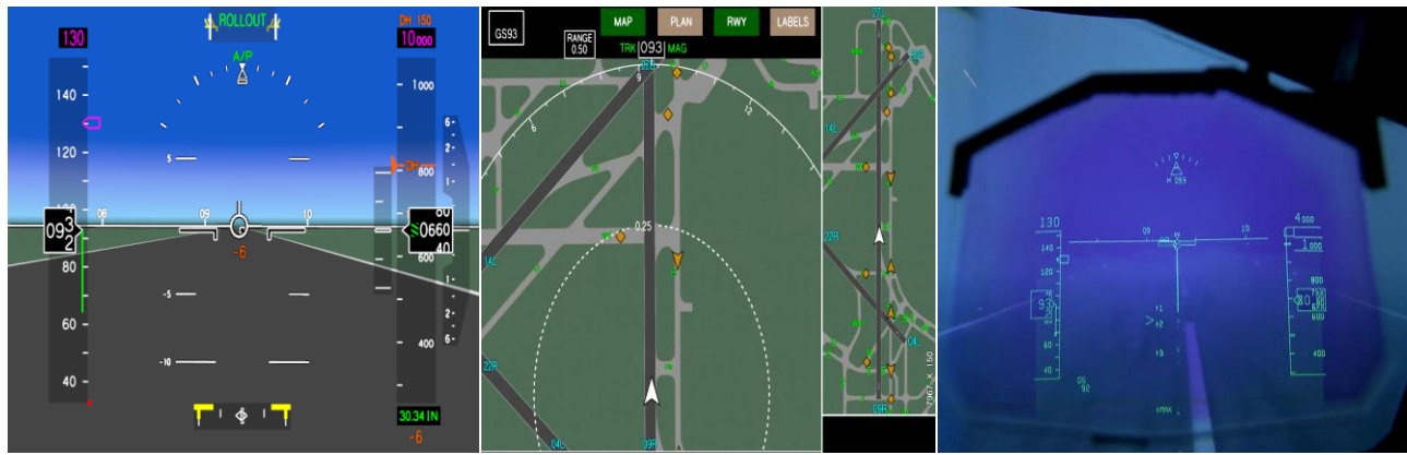
Primary Flight Display