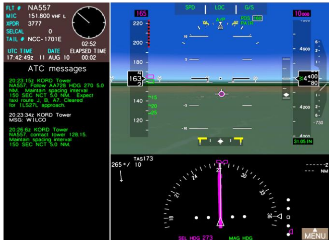
PF Left Display

traffic identification and correlation between the head-down CDTI and the Head-Up traffic information.