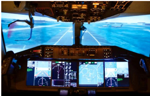
Figure 2. NASA Full-Mission Flight Simulator

The full-mission RFD simulates a Boeing B-757-200 aircraft, albeit controlled through sidestick inceptors. A collimated out-the-window scene is produced by an Evans and Sutherland Image Generator graphics system providing approximately 200° H by 40° V field-of-view at 26 pixels per degree.