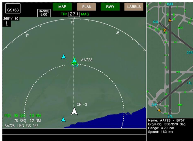
PNF Left Display