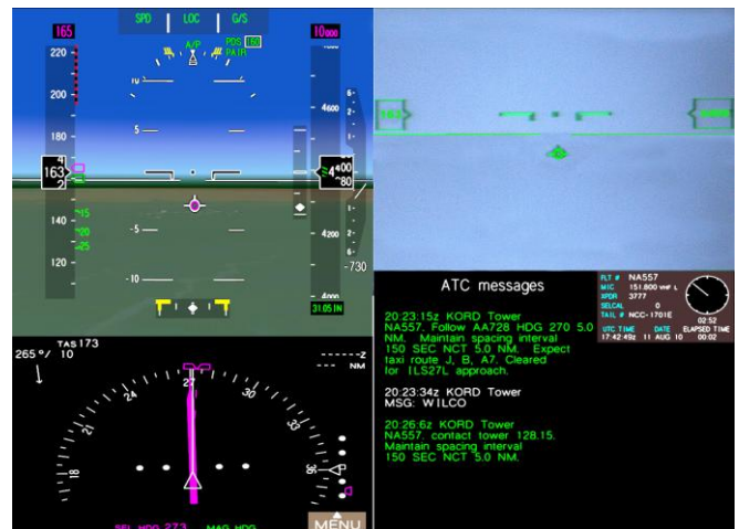
PNF Right Display