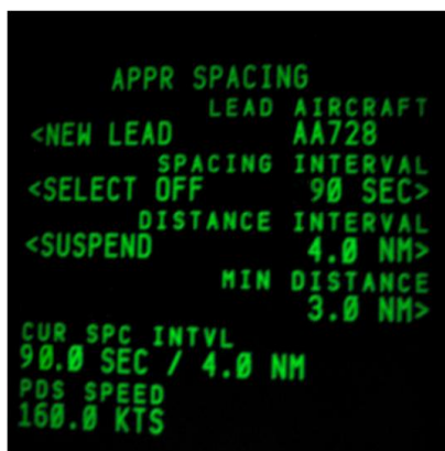
Figure 5. Approach Spacing FMS CDU Page

Flight crews were briefed that to accept any FIM-DS clearance, the PF (on the HUD) and PNF (on the repeater display) had to observe both an ADS-B paired aircraft box and a FLIR return within that box. A progress page and a dedicated FIM page were created on the FMS CDU that enabled the flight crews to input the parameters specific to the ATC clearance to achieve the time-based objectives: either FIM-S or FIM-DS. Flight crews were briefed that the PNF should display the FIM page (Figure 5) throughout the approach and the PF should display the progress page or other pages as determined by their company standard operating procedures.