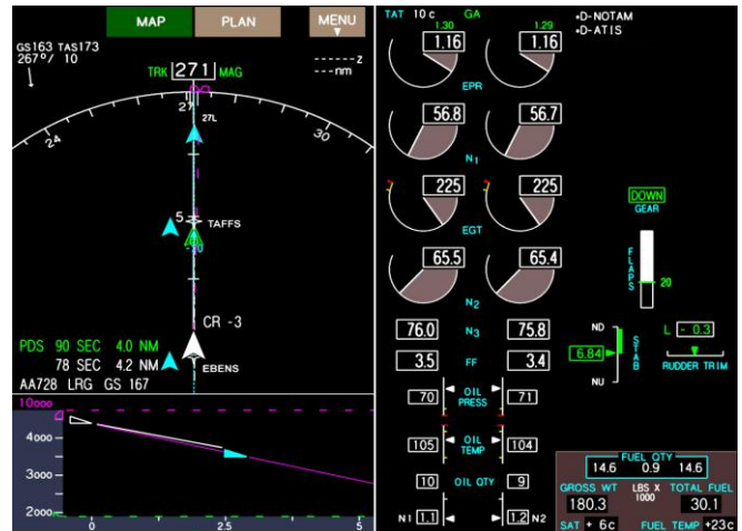
PF Right Display