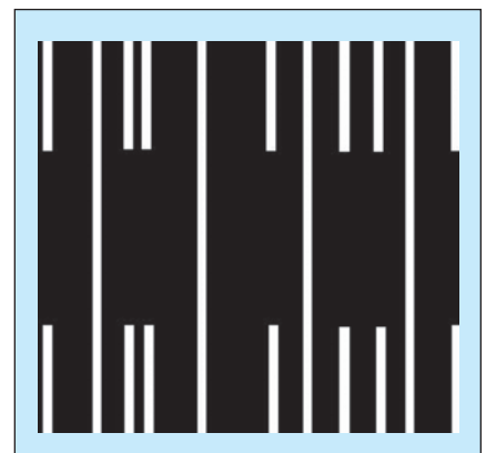
Figure 2. Portion of New Scale Pattern , partly resembling common bar code, is representative of vertically binnable patterns used in encoders of the type described in the text.

which the position of the scale pattern is to be measured. The pattern includes vertically oriented fiducial bars plus small rectangles or squares, representing code bits, that serve to uniquely identify the fiducial bars (see Figure 1). The lower limit on conversion time is determined primarily by the exposure time and the time required to read out the