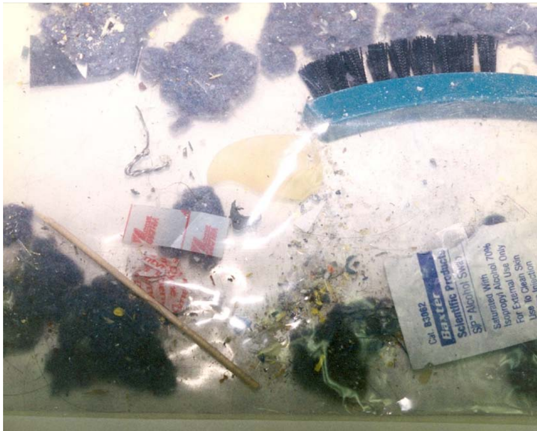
Figure 2. Particulate Debris From Air Filters.

Particulates were also measured in the crew compartment and showed an unusual size distribution over time in the crew compartment (26). As expected larger particulates that settle quickly on Earth remained suspended much longer in the microgravity environment of the Space Shuttle. Debris of assorted material was collected on the 70-300 micron stainless mesh filters (Figure 2). A cabin air cleaner was installed during the Extended Duration Orbiter Medical Project to remove particulates and microorganisms. This resulted in reductions in airborne particulates and microorganisms and fewer crew complaints. This cabin air cleaner was later used on all Space Shuttle missions.