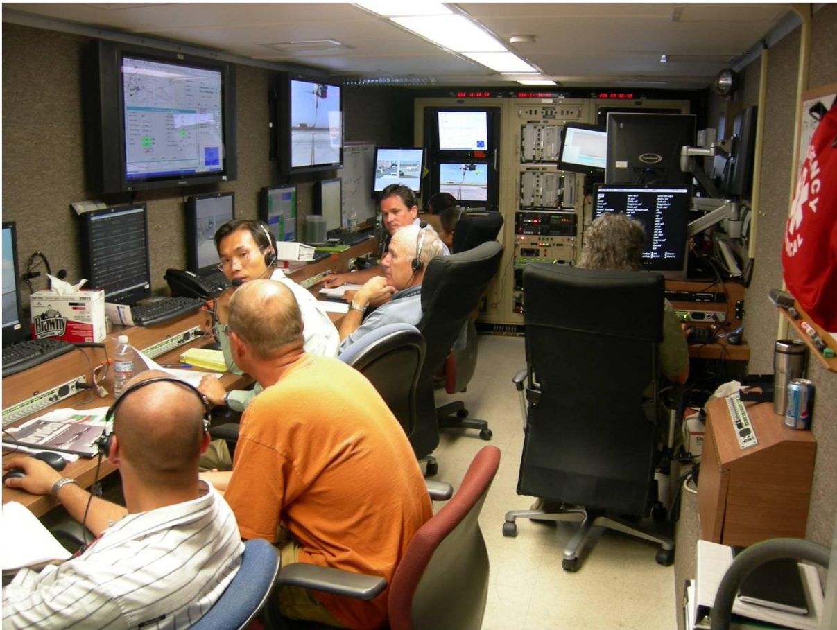
Figure 4. NASA Ikhana Ground Control Station. Engineers and technicians monitor aircraft systems and science instrument in the foreground, while pilots fly the aircraft at the far end.

Finally, flying from a ground control station brings with it some unique people problems. In the cockpit, I have a “private office” in the sky. But in the UAS control station, people come and go, resulting in casual conversations when the flight crew’s attention is not saturated, and demands for silence when things get busy (Fig. 4). Moreover, hushed approaches and landings can be interrupted by ringing telephones, and there are times when whispered remarks behind the pilot’s console—“Monday Morning Quarterback-ing”—can undercut concentration. Some onlookers also liken UAS flying to a video game. They are not wrong—with a big exception. Flying is much more than moving a stick and throttle. Pilots possess a body of knowledge sometimes called “airmanship,” which is a complex of skills involving FAA regulations, air traffic control and communications protocols, weather forecasting and aircraft performance, navigating in the National Air Space, and very important aircraft systems knowledge and knowledge of emergency procedures.