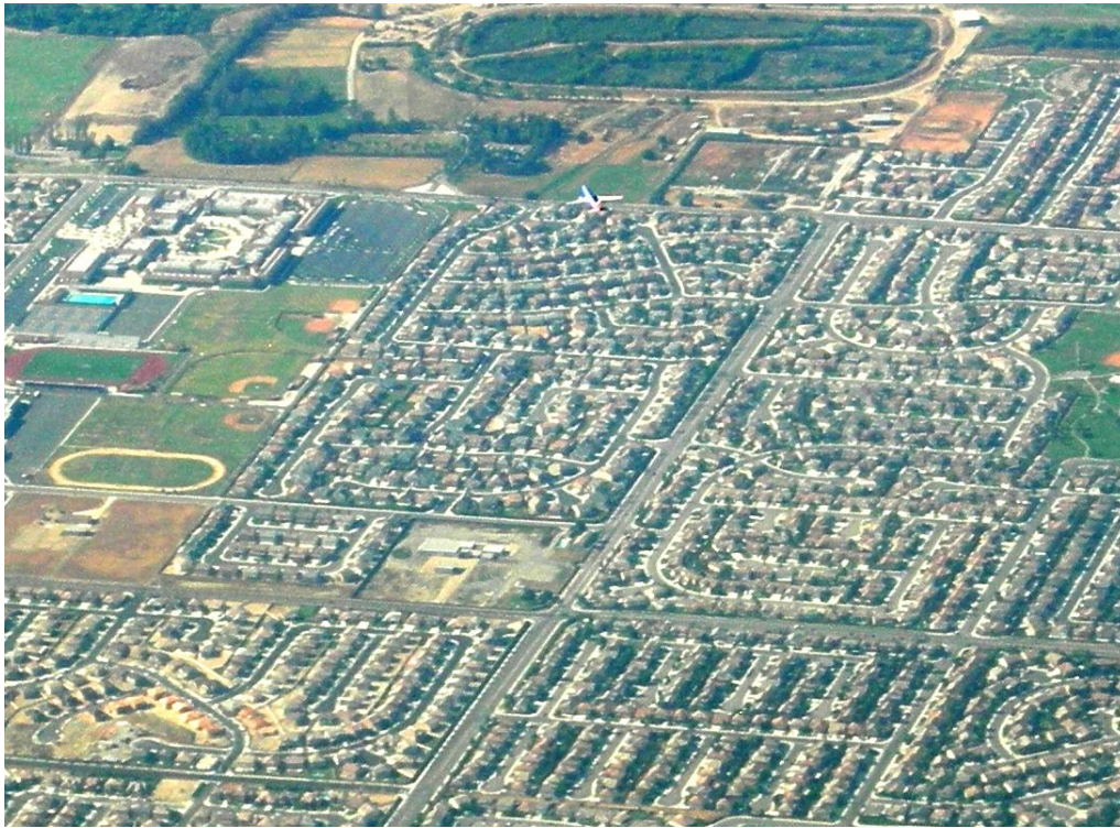
Figure 7. With the exception of seeing a contrail against a clear sky, visually tracking other air traffic can be difficult. A number of factors (for example, lighting, atmospheric filtering, color, contrast, et cetera ) contribute to the challenges of visually recognizing potential conflict, especially against a “busy” background of variable shapes and colors. Note airliner at upper center of photograph.

size, texture, atmospheric filtering, contrails, reflectivity, visual acuity, weather, and external lights affect our ability to see other airplanes (Figs. 7 and 8). Indeed, on the same day that I saw a contrail over 80 miles away, Air Traffic Control told me that a light aircraft was detected less than 2 miles away from me, 1,000 ft below my altitude. I searched desperately for it against the background of a densely populated city, but never did see it.