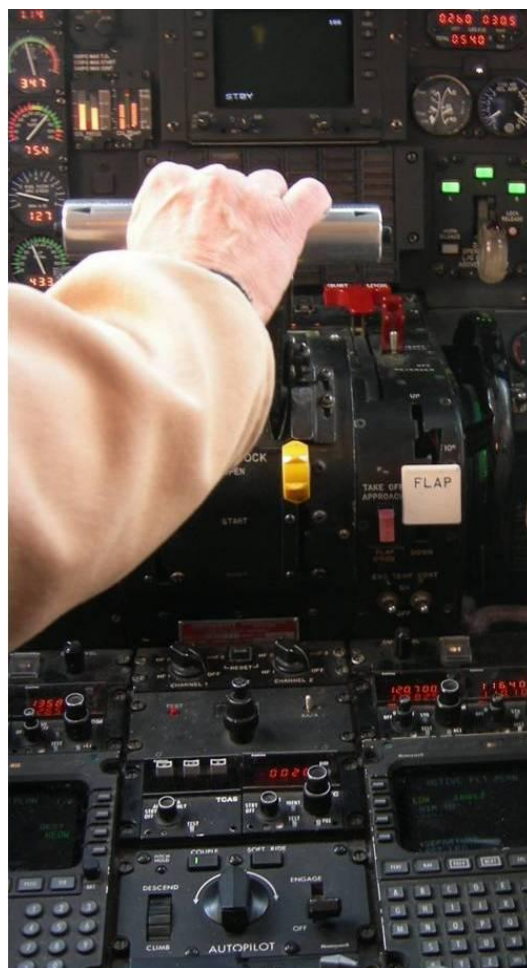
Figure 6. Typical cockpit displays and controls. Analog gauges marked with normal (green arc) and red-line ranges of values (upper left). Distinctively shaped flap handle, landing gear handle (below the three green lights), and autopilot switches (lower center) enable multitasking without diverting attention to look at them. Green landing gear lights are “mapped” in relative positions to nose and main landing gear.

In the case of the MQ-9 control station, which is contained in a mobile trailer or a building, almost all of the “switches” are activated by a keyboard (essentially, identically-shaped “switches”) and a trackball. The switches are menu-driven commands, embedded in software, and displayed on various screens. The pilot faces four screens. One screen displays a forward-facing camera’s view, another displays maps with a moving aircraft icon; two others display systems information, cautions and warnings, and operations menus that are selectable through a keyboard and mouse or trackball (Fig. 3). On these informational-cautionary screens, one “page” of information is shown at any time, but more than 60 additional pages are available. Each page contains different types of information about systems performance (for example, servo amperages, fuel tank quantity, rudder deflection, and planned route of flight). The control station is also equipped with traditional control stick (Fig. 3), throttle or prop levers, and rudder pedals required to fly the aircraft from taxi, through takeoff, cruise, descent, and landing. Also