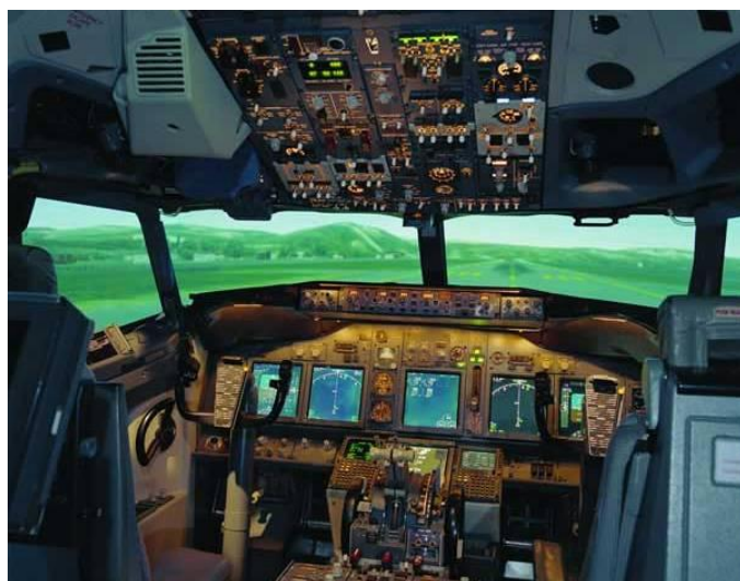
Figure 5. Manned aircraft, with multiple windows, provide a wide field of view to pilots. Digital information can be displayed in human-friendly analog format on the multifunction display screens.

Similarly, traditional cockpit displays (Figs. 5 and 6)—mostly analog gauges—have needles that point at numerical values. Many gauges are labeled with “green arcs” and “red lines,” indicating the normal range of values, or limits, respectively. During typical flight, the pilot routinely devotes time and attention to the assessment of information. A quick glance across analog gauges affords the pilot a “normal” assessment if gauges are pointing in normal directions; the pilot does not need to read the actual numbers. In the same glance, the pilot can detect a needle pointed in an “abnormal” or “unsafe” direction, and assess that condition by noting the numerical value. In digital presentations, precise numbers are displayed, but the pilot must take precious moments to determine whether each number is within the normal range or is trending toward the abnormal.