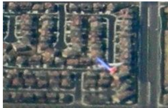
Figure 8. Airliner seen against city background. This particular airliner is painted in bright colors, which helps in distinguishing it against the background. UASs, in order to comply with FAA procedures and regulations regarding “sense and avoid” capabilities, will likely require a fusion of data sources (that is, visual, radar, and infrared) provided to both UAS pilots and air traffic controllers.