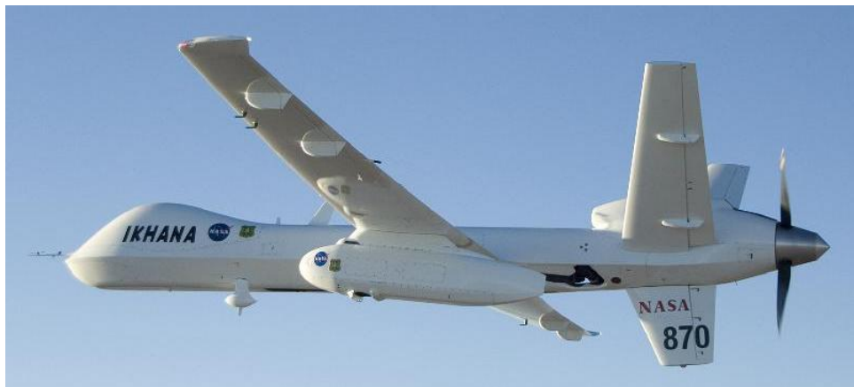
Figure 2. Ikhana equipped with a wing-mounted pod, carrying an infrared sensor for a wildfire research mission. The UAS is capable of transmitting imagery and locations of hot spots and fire lines directly to fire incident commanders via a satellite link.