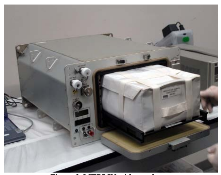
Figure 3. MERLIN with pouch

MERLIN is compatible with Shuttle Middeck, MPLM, ISS, Progress, ATV and HTV. In the future it can be certified for future vehicles such as SpaceX Dragon and Orbital's Cygnus Vehicles.