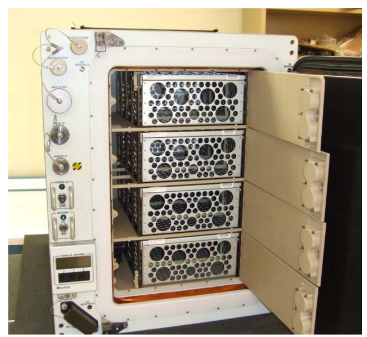
Figure 4. Glacier with door open showing regular size trays