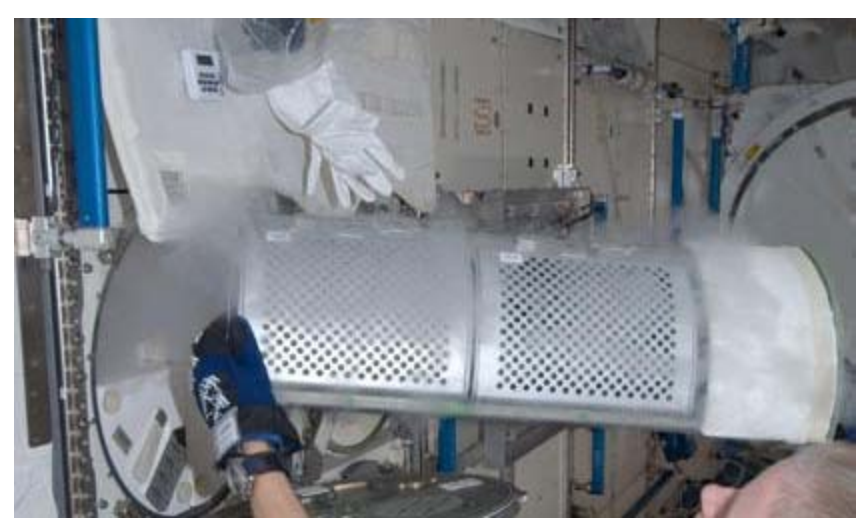
Figure 2. MELFI Tray Insertion