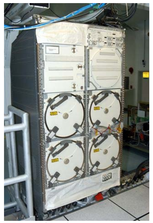
Figure 1. MELFI

There are three MELFI Flight Units on ISS. Currently Flight Unit 1 and 3 are in the Japanese Experiment Module (JEM) and Flight Unit 2 is in the US Lab. There is also one Training Unit, one Laboratory Ground Model (LGM), and one Engineering Qualification Unit (EQM) all located at Johnson Space Center (JSC).