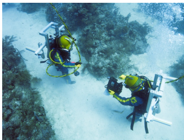
Fig. 1. Two crewmembers on EVA to photo-document and record the location, health, and size of a coral mound.

The Science Platform: Aquarius is used by marine scientists to study coral reefs because saturation diving maximizes “bottom time” for a research diver. ARES uses “coral science” as a proxy for “planetary science” to train aquanaut/astronauts to use their cognitive and analytical skills for data collection and documentation on the ocean floor in a manner similar to planetary surface operations (Fig. 1).