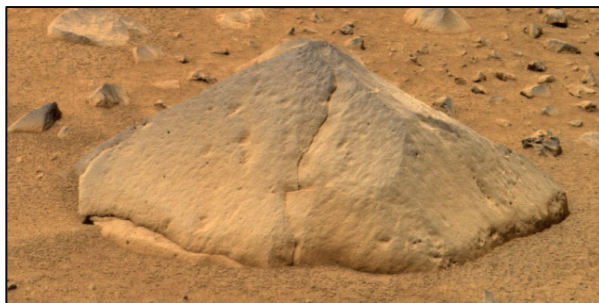
Figure 3: Pancam image of Adirondack in Gusev Crater, Mars displaying an increasingly thicker dust coating from top to bottom [8].