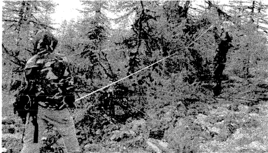
Pasha Oskorbin and Paul Montesano measure the height of a fallen larch tree, July 29, 2007.

Tomorrow we plan to move down river to locate and verify measurements made by NASA satellites. But that's tomorrow. Now it's supper time. Mmm...fish soup.