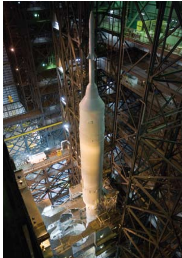
The TEAMS toolset was employed on the Ares I-X test vehicle, shown here at Kennedy Space Center's vehicle assembly building. TEAMS is also applicable to transportation systems, medical equipment, factory systems, telecommunications, and refinery systems.

First featured in Spinoff 2001, today the toolset includes TEAMS-Designer, a program that creates a