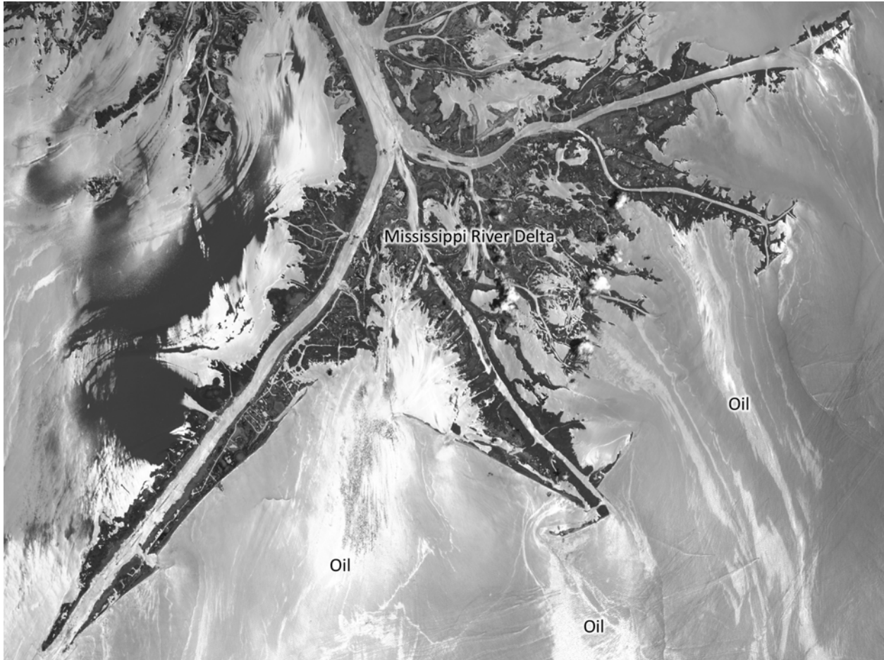
Figure 4: ASTER Image Showing Oil Slick Approaching the Mississippi River Delta in Southeastern Louisiana on May 24, 2010. Oil Appears as White Sheen. Annotation by NASA DEVELOP.