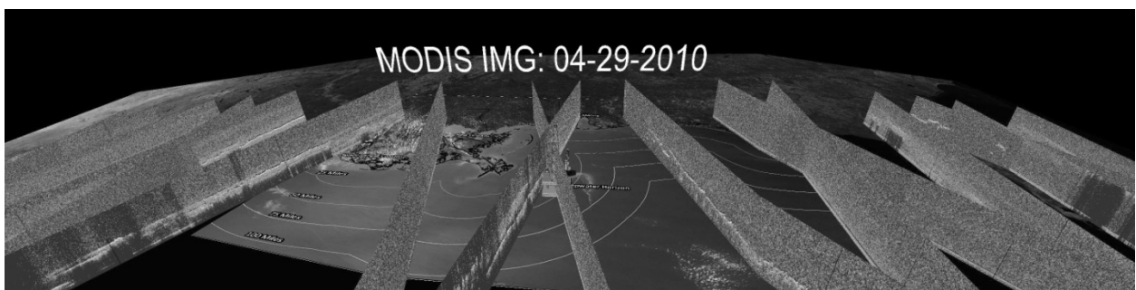
Figure 2 – Still Frame from DEVELOP’s CALIPSO CALIOP Visualization. CALIOP Data Tracks are Overlaid on a Background MODIS Image.