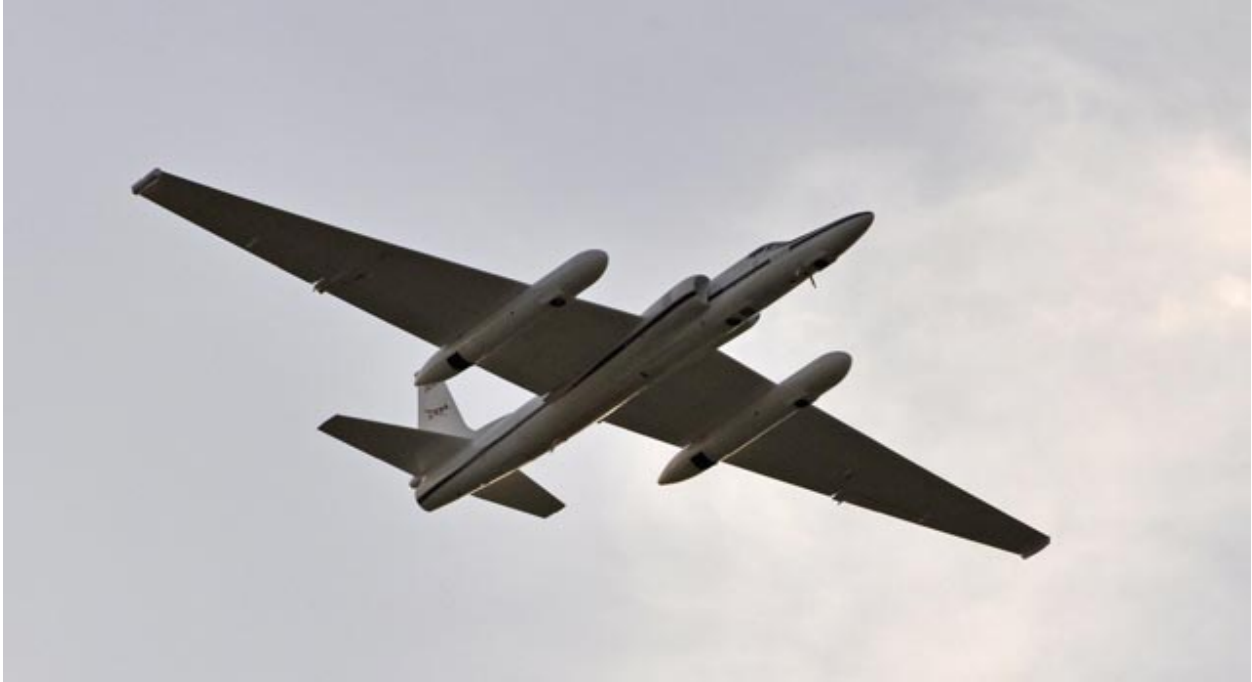
Figure 5: NASA's Earth Resources-2 (ER-2) Aircraft Carrying the AVIRIS Sensor.