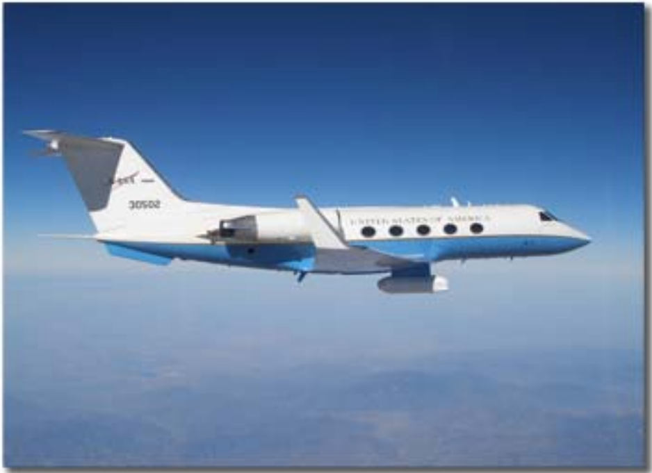
Figure 6: NASA's Gulfstream G-III Aircraft with UAVSAR Mounted Underneath.