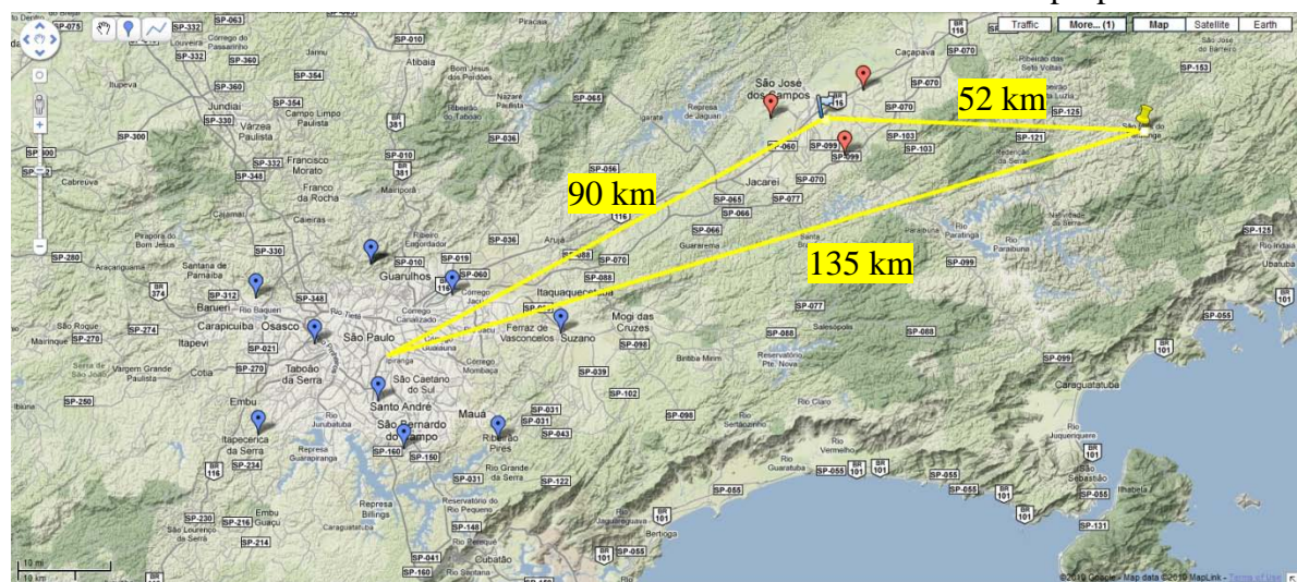
Figure 3 - Blue balloons show preliminary configuration for the SPLMA network for CHUVA. The red balloons show a second network configuration, centered at INPE (Sao Jose dos Campos). Yellow “push pin” is the São Luiz do Paraitinga CHUVA IOP site. Yellow lines show distance between the networks and CHUVA IOP.

Figure 3 shows the preliminary layout for SPLMA, where the blue balloons are the suggested locations for 9 stations around the city of São Paulo. The red balloons are additional stations under consideration around the city of São José dos Campos, closer to CHUVA IOP site (São Luiz do Paraitinga – yellow “push pin”). The São José dos Campos LMA network is centered at INPE, where an instrumentation tower with high speed cameras and other instruments can add valuable information for GLM and CHUVA purposes. Since a