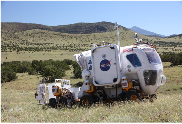
Figure 1. NASA- Johnson Space Center's Space Exploration Vehicle

is such that a margin constraint will eventually be violated.