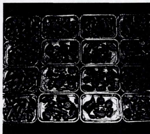
Figure 2. Harvested sweetpotatoes from one-half of the chamber (5.6 m 2 )