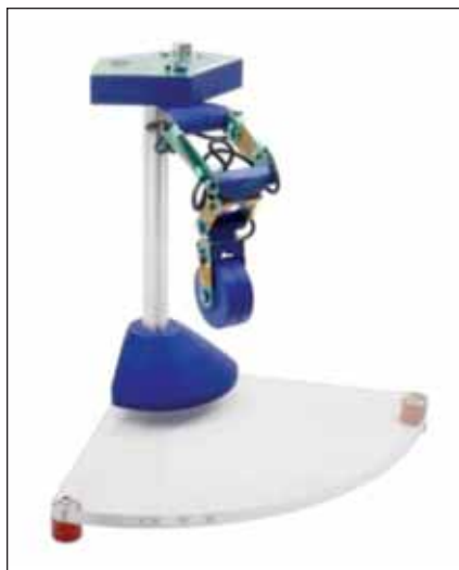
Tele-Robotic ATHLETE Controller for kinematics.

TRACK includes rotary sensors (potentiometers) for each ATHLETE