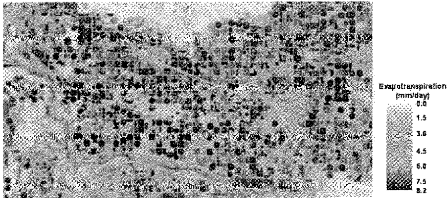
Figure 3: Evapotranspiration derived from from Landsat 5 data on July 22, 2006 from irrigated fields in the Thousands Springs area, Idaho. Round circles are center pivot irrigated fields 800 m in diameter.

measure evapotranspiration (evaporation from soil and transpiration from plants); to map urban heat fluxes, to monitor lake thermal plumes from power plants; to identify mosquito breeding areas and vector-borne illness potential; and to provide cloud measurements (see e.g. [7, 6, 3, 4]). The evapotranspiration data may be used to estimate consumptive water use on a field-by-field basis. Figure 3 shows an example of the evapotranspiration data product derived from Landsat 5 using the University of Idaho METRIC process [1].