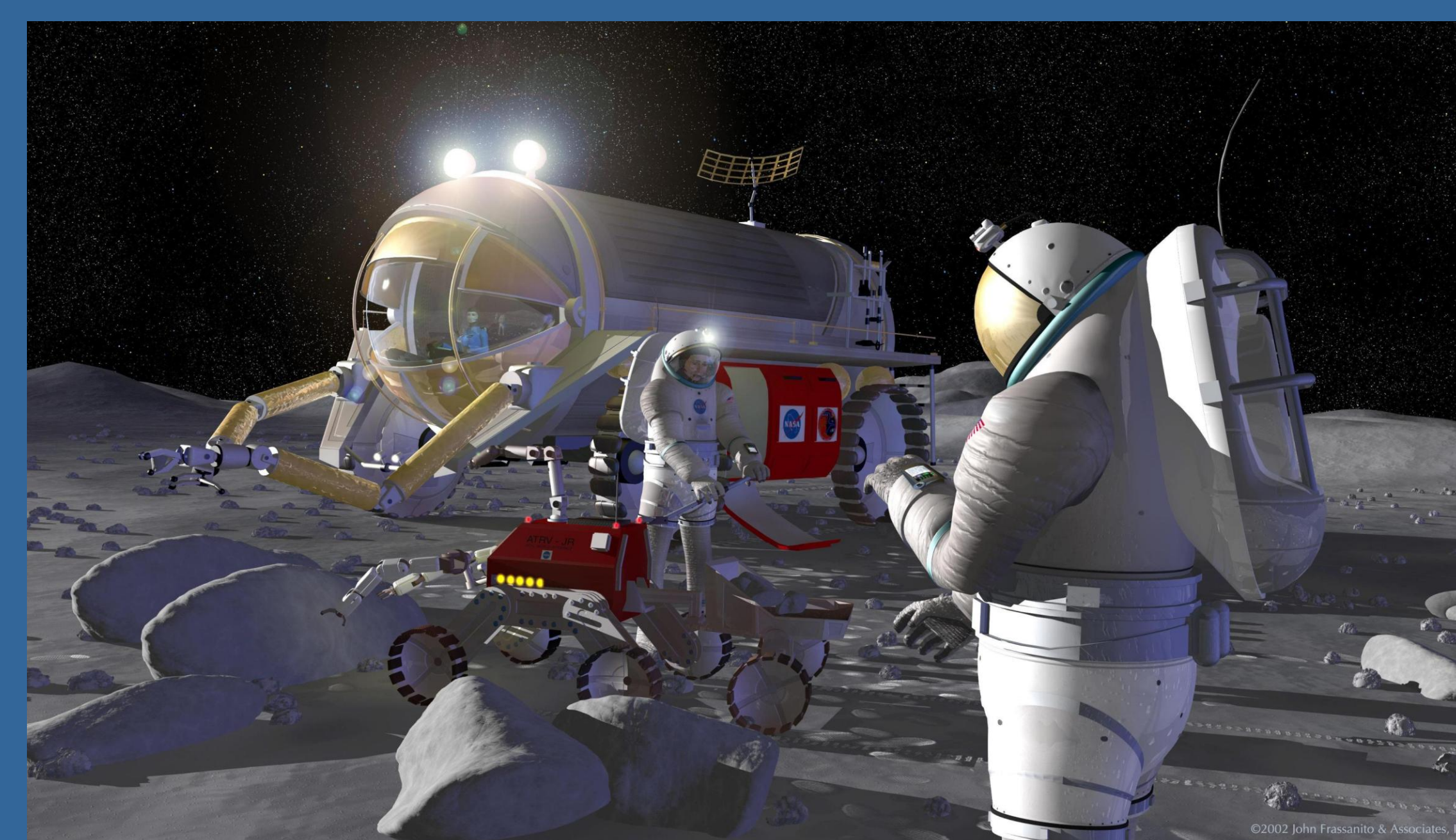
Artist's Concept of Manned Exploration Mission, NASA