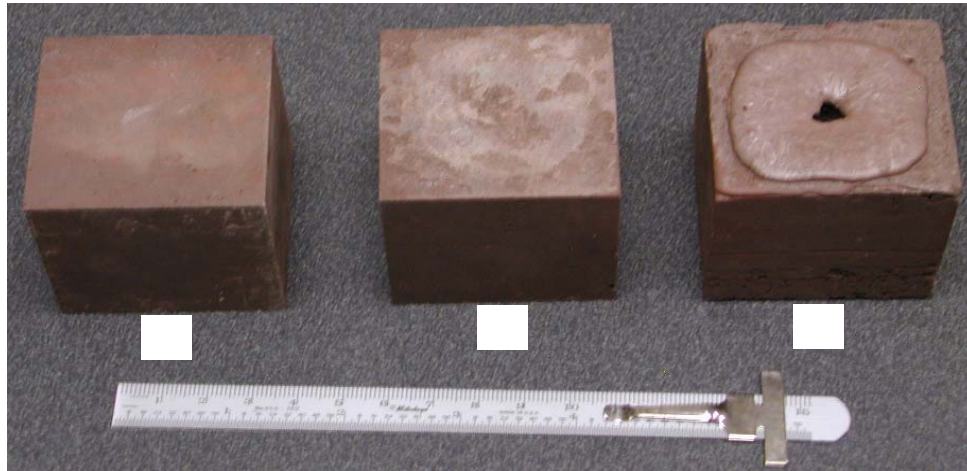
Figure 2 shows hardened sulfur concrete specimens after cooling. Specimen (C) on the right was poured into an unheated mold while the other two specimens (A and B) were poured into a heated mold. The unheated mold caused the sulfur concrete on the outside to cool faster resulting in a hollow hole, while the other two samples lack holes because the mold was heated. It is also important to shake the mold so that no entrapped air pockets are formed.

Over 12 cubic specimens were made. The tested specimens are shown in Table 1. Group A specimens are made of coarse and fine aggregates, cement, and water with water-to-cement ratio of ~0.4, Group B specimens consisted of JSC-1 Lunar Regolith Simulant (65%) and sulfur (35%).