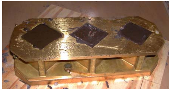
Figure 1: Pouring sulfur concrete in molds.