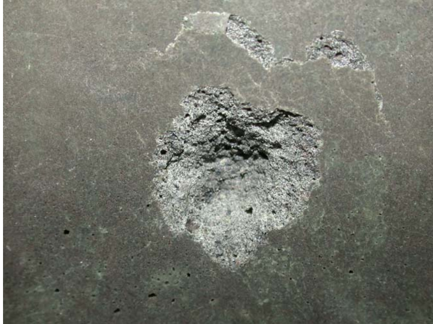
Figure 3: Sulfur concrete sample after impact by 1-mm diameter aluminum projectile at 5.85 km/s. Horizontal diameter ~12 mm; vertical diameter ~14 mm; crater depth ~3 mm. Crater diameter was presumably increased by a conical shatter zone. A larger fractured zone is evident above the crater, and its inferred diameter would be ~20 mm. Internal damage to the specimen is currently unknown.