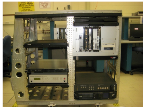
Fig. 3. DC-8 medium-size pallet for Electronics and DAPDS