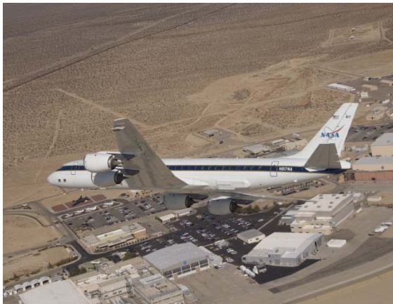
Fig. 1. Dryden Flight Research Center's (DFRC's) DC-8 Airborne Laboratory

The project requires acquisition of 55,000 lidar return samples at 10 Hz rate while accumulating 20 pulses at each look direction. The laser beam is directed to five different look directions to correlate the measurements to provide wind profile parameters such as wind direction, wind speed, power distribution, and Doppler shift. The DAPDS is responsible for data acquisition up to output product display while controlling the scanner to point the laser beam to each user-defined look direction. The DAPDS has to overcome the large amount of computationally intensive data processing overhead and it accomplishes it by means of optimization of data transfer and processing. A general overview of the system and its software is presented in latter sections