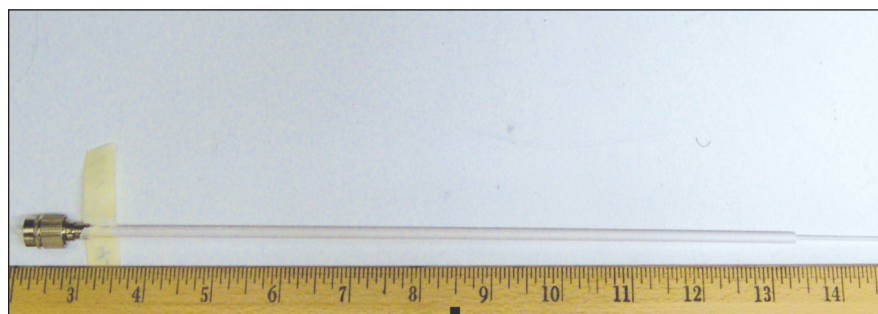
Figure 1. A Probe packaged and connectorized with a fiber Bragg grating (FBG) inside. The FBG is located at the end of the probe inside a smaller-diameter ceramic tube.