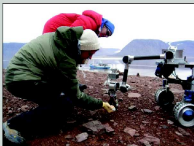
Figure 1. Sampling the rover claw surface while participating in the field exercises of the Arctic Mars Analogue Svalbard Expedition (AMASE 2009).