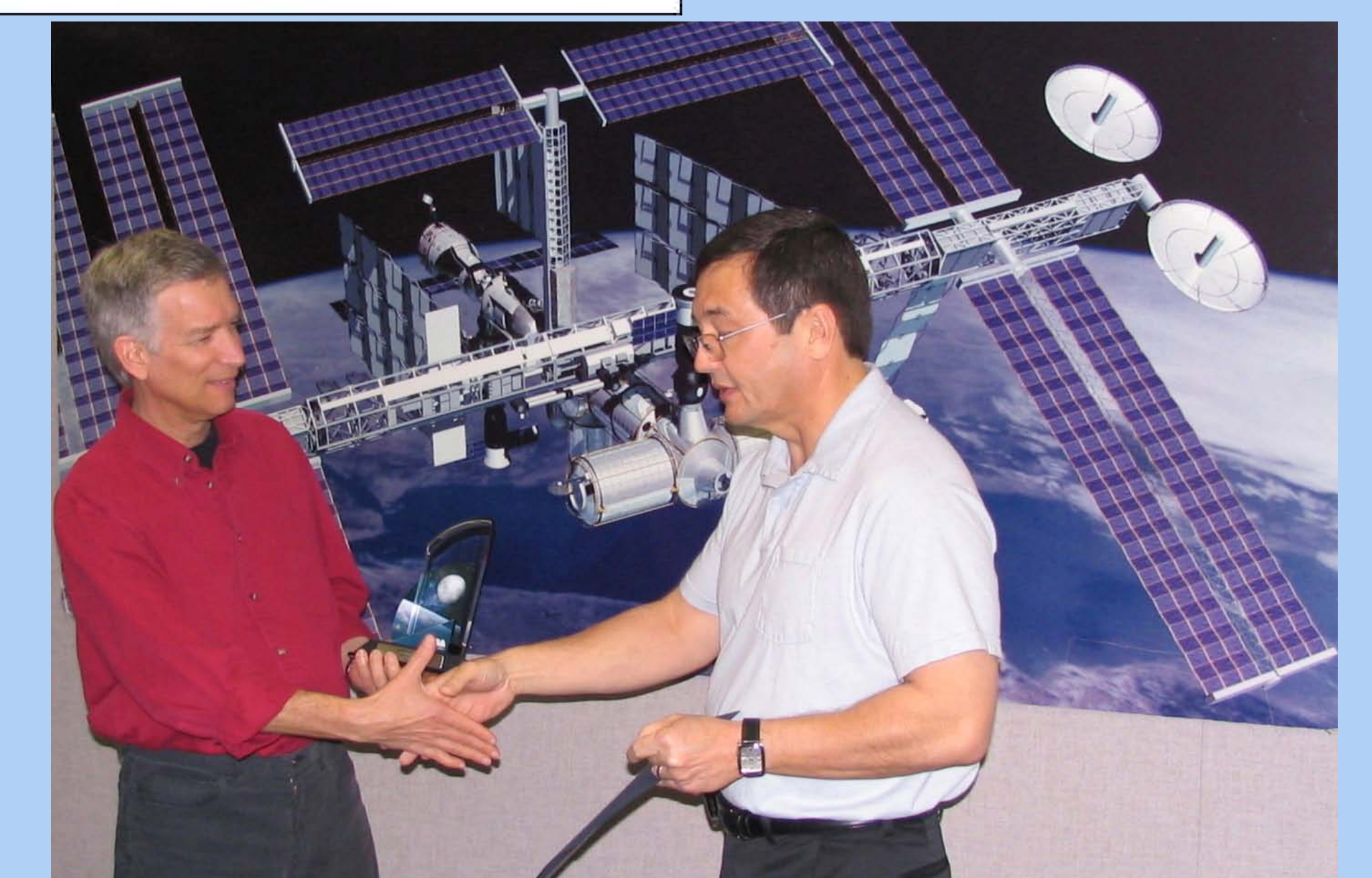
SHFE/Training PI receives USA Award