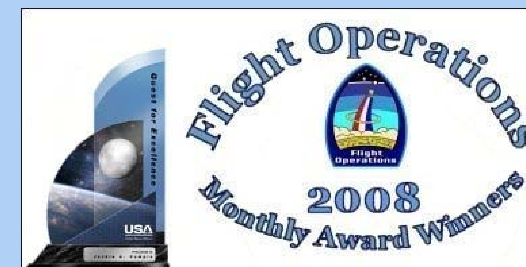
MOD SFRM WG members receive USA Award