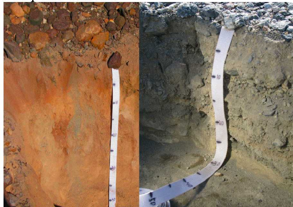
Fig. 3. Soil pits sampled: UV on left; TV on right.

cemented soil. The clay fraction is dominated by amorphous or short-order aluminosilicates along with mica, feldspar, amphibole, kaolinite, and vermiculite, weathering products of primary igneous and volcanic parent materials. Specific surface area of the soils also increased with depth, which we interpret to be a result of the increasing clay content. The high amorphous content in the clay fraction of lower horizons (above the ice-cemented soil) suggests translocation of clays and aqueous alteration of primary phases to form amorphous materials.