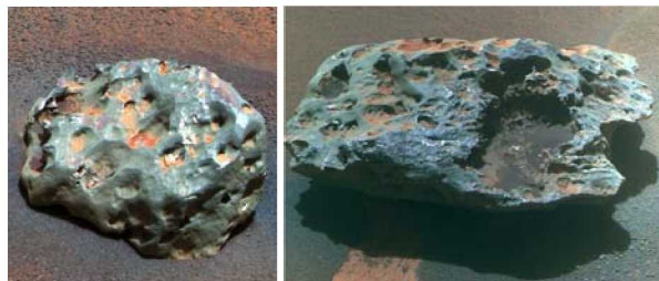
Figure 1: Heat Shield Rock (left, ~30 cm across; Sol 346, sequence P2591, filters 257) and Block Island (right, ~60 cm across; Sol 1961, Sequence P2537, filters 257).

Introduction: The Mars Exploration Rover Opportunity has encountered four iron meteorites at its landing site in Meridiani Planum. The first one, informally named “Heat Shield Rock”, measuring ~30 by 15 cm, was encountered in January 2005 [1, 2] and officially recognized as the first iron meteorite on the martian surface with the name “Meridiani Planum” after the location of its find [3]. We will refer to it as “Heat Shield Rock” to avoid confusion with the site. Between July and October 2009, separated ~10 km from Heat Shield Rock, three other iron meteorite fragments were encountered, informally named “Block Island” (~60 cm across), “Shelter Island” (~50 by 20 cm), and “Mackinac Island” (~30 cm across). Heat Shield Rock and Block Island, the two specimens investigated in detail, are shown in Figure 1. Here, we focus on the meteorites’ chemistry and mineralogy. An overview in the mission context is given in [4]; other abstracts discuss their morphology [5], photometric properties [6], and their provenance [7].