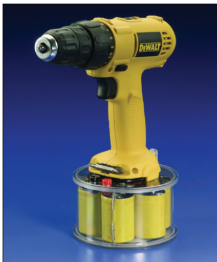
The Power Pack attached to the bottom of the handle of the power drill utilizes ultracapacitors, rather than batteries, to store energy.