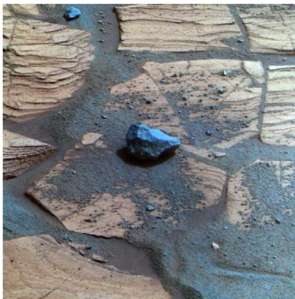
Figure 1. Pancam false color image of Santorini (Sol1713B_P2588_1_False_L257). The upper surface shows a relatively high reflectance.

Pancam: Santorini and its angular features are shown in the Pancam image in Figure 1. The cobble measures approximately 6 by 8 cm. The top of the rock shows a relatively high reflectance, maybe as a result of wind-polishing. Pancam spectra show a broad downturn towards 1009 nm consistently across its surface. Santa Catarina is part of an extended cobble field which showed two different spectral types: One with a broad NIR absorption with an apparent band minimum