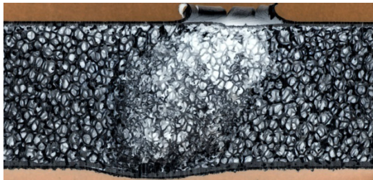
Figure 2. Foam core sandwich panel damage following impact of an aluminum sphere at hypervelocity.

Under loading, the microstructure of metallic foams collapses plastically at a near-constant stress (plateau stress), providing them with a long, flat stress-strain curve and the ability to absorb large amounts of energy by plastic deformation. As a result, foam structures have commonly been considered as good protective materials to mitigate shocks and blast loads. However, improperly designed foam structures under more intensive external loads (e.g. blast) have been found to actually increase transmitted pressure loading if the densification regime is rapidly reached [9]. For MMOD impact, the relevant load case is a radially expanding solid/liquid/gas cloud at hypervelocity. Under these conditions plastic deformation and compaction of foam ligaments at the leading edge of the expanding debris cloud is expected to provide a degree of energy absorption as the response is localized. In Figure 2 a foam core sandwich panel is shown following impact of a 2.7 mm diameter Al2017-T4 sphere at 6.99 km/s with oblique (45°) incidence. The image colors have been inverted to highlight the compacted region of foam at the leading edge of the damage cone.